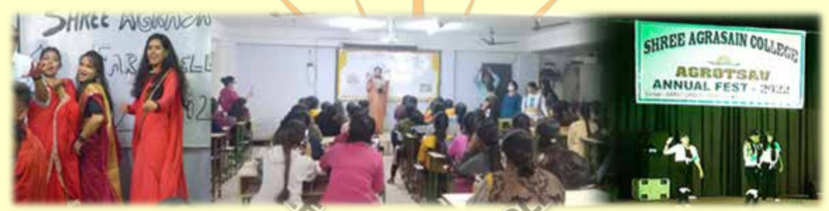
Cultural Events : Agrotsav, Pre-Puja Celebration, Hindi & Vasha Diwas